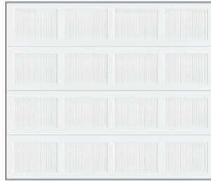
Recessed Colonial Grooved